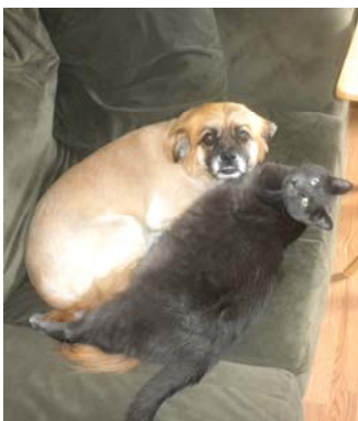
Gracie & Brady-CAUGHT!